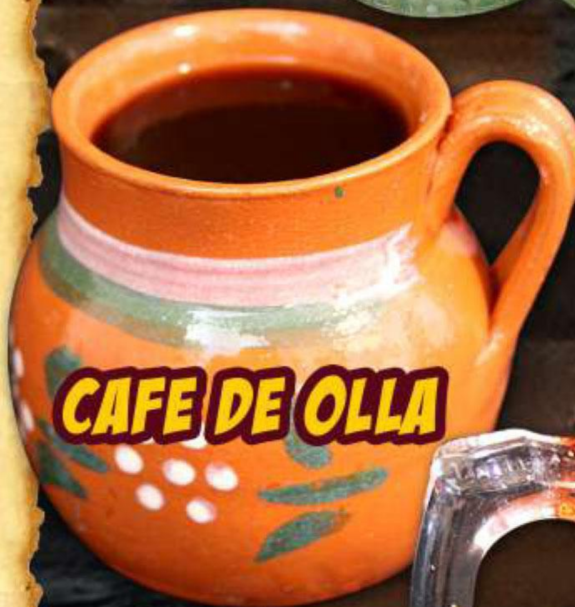
CAFE DE OLLA