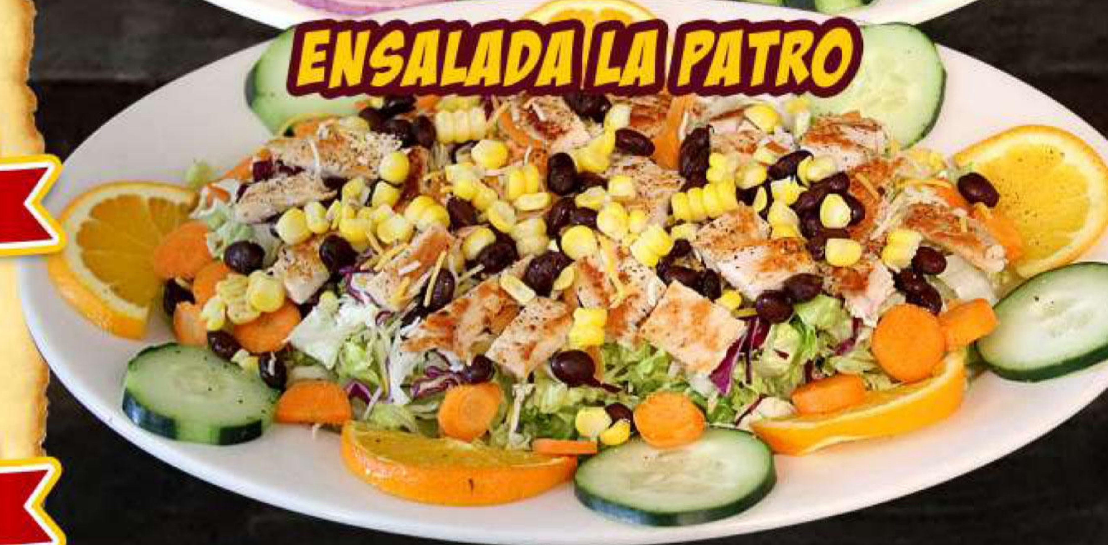
ENSALADA LA PATRO