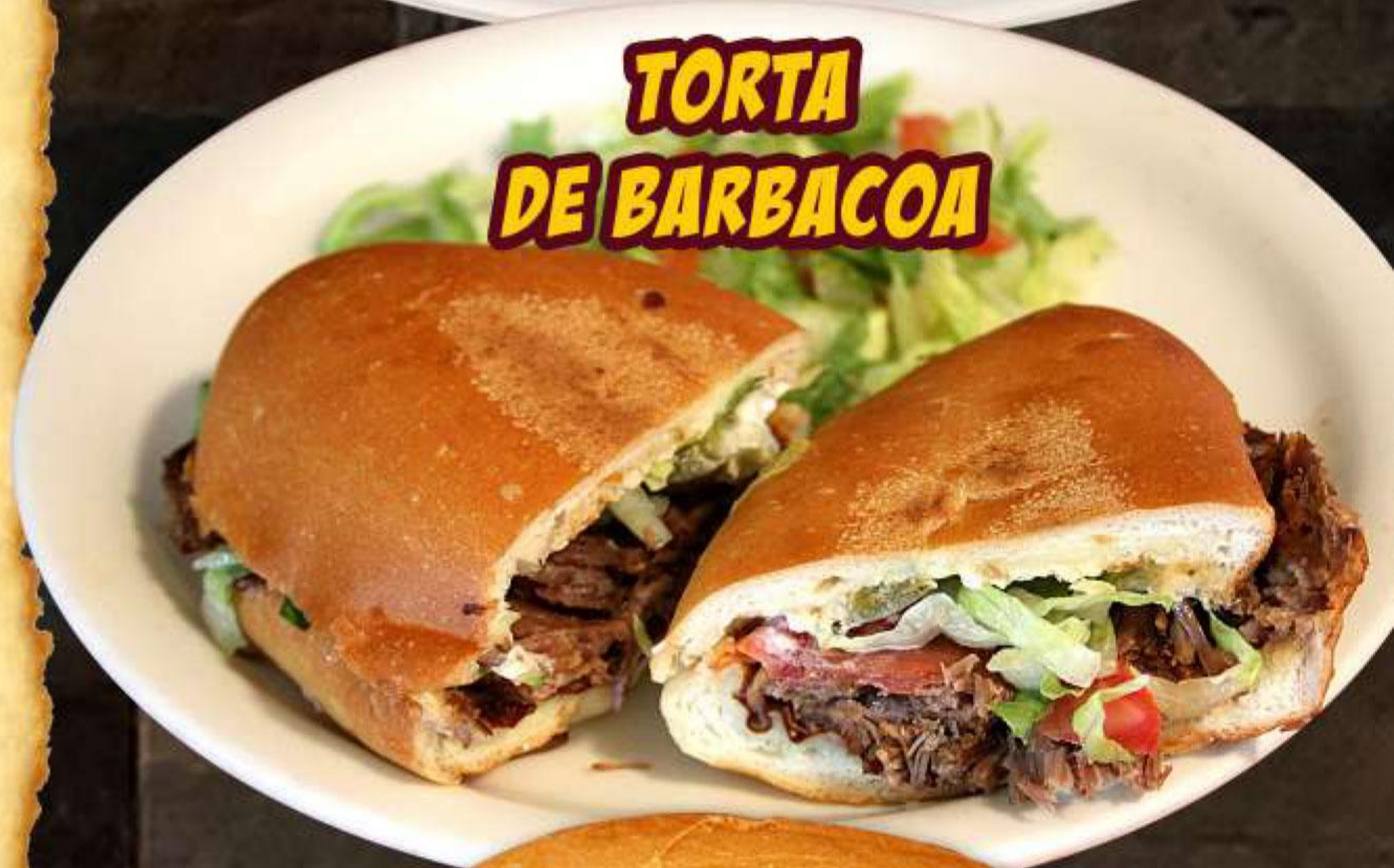
TORTA DE BARBACOA