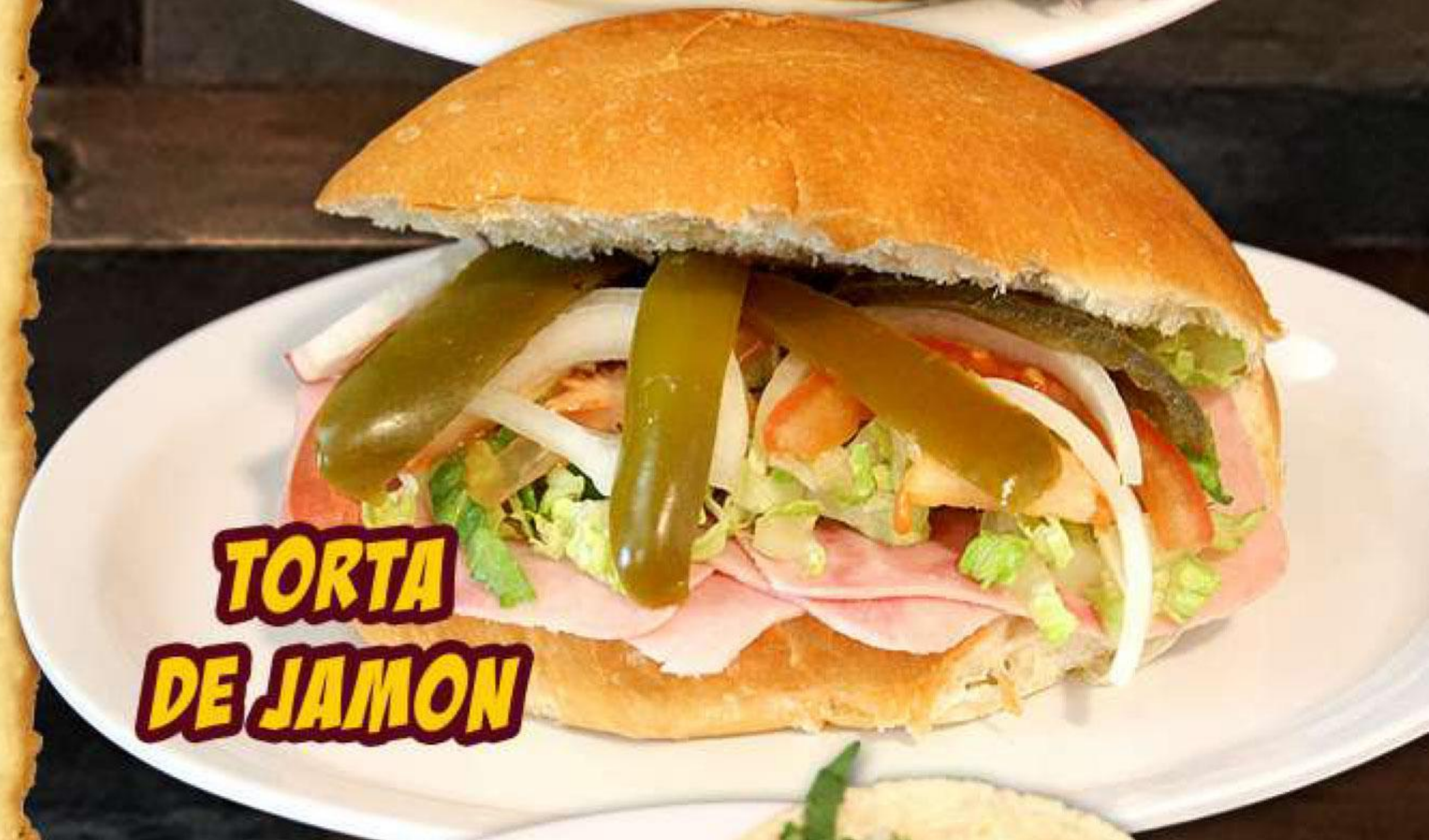
TORTA DE JAMON