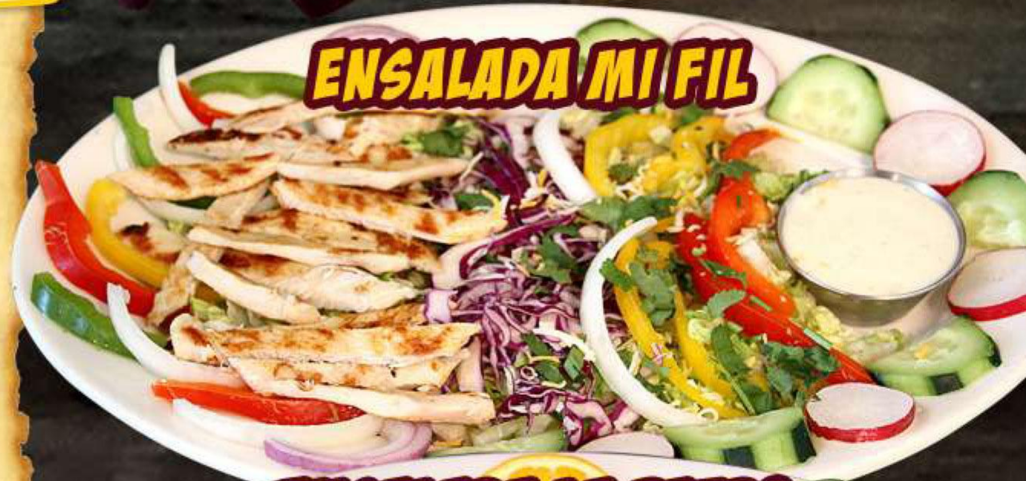
ENSALADA MI FIL